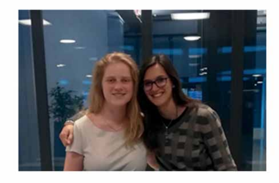
Remember that fear is only temporary. Regrets last forever!

We hope this guide will prepare you well and help you make the right decisions, so that your exchange experience will be everything you imagine it to be and more!